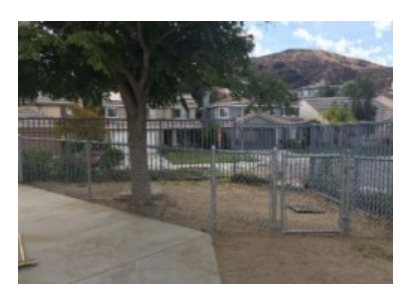
New fencing at Mountainview

Saugus Union School District has an active parent participation at all sites with School Site Councils and Parent Teacher Organizations supporting community and educational needs at each school. Representatives of these organizations join together to form the Parent Advisory Committee (PAC) to meet and share information under the leadership of the Superintendent.