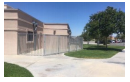
Outside door remodel for Highlands (I) & new fencing for Mountainview (r)