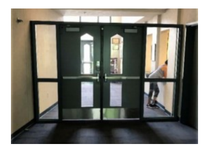
New single point of entry at North Park (from inside)