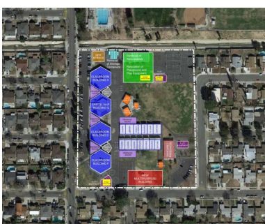
Facilities Planning Sessions with Cedarcreek Elementary