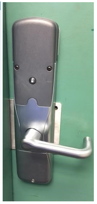
New security lock upgrades