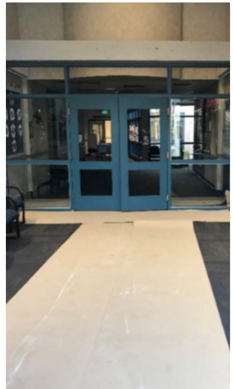
Bridgeport's new single point of entry