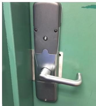
New security locks were provided for many of our schools, with more to come over the next several months

We will continue to provide updates on the status of Measure EE projects through these newsletters, but we wanted to put some of those projects in context.