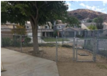
New fencing at Mountainview

Saugus Union School District has an active parent participation at all sites with School Site Councils and Parent Teacher Organizations supporting community and educational needs at each school. Representatives of these organizations join together to form the Parent Advisory Committee (PAC) to meet and share information under the leadership of the Superintendent.