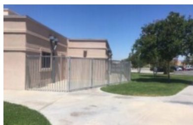
Outside door remodel for Highlands (l) & new fencing for Mountainview (r)